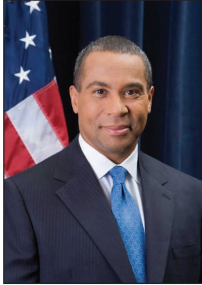
Deval Patrick, Governor

Order your free planning guide from the U.S. Department of Health & Human Services that explains how to get started planning for long-term living. The guide includes many Massachusetts-specific resources to help you prepare for the years ahead. Order the guide. Begin making plans. Plan for a Long Life!